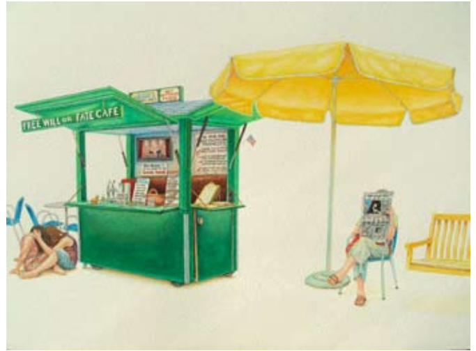
Free Will or Fate Café, 2009 , watercolor/paper, 22" x 30".

The work is by no means just doom and gloom. Some of the watercolors feature odd buildings ("The Café of Infinite Possibilities", "The Smiling Theater") covered with a text of their own. While the text may actually be advertisements, it does not attempt to pound information and slogans into the subconscious; instead, it questions and investigates how to move into an uncertain future.