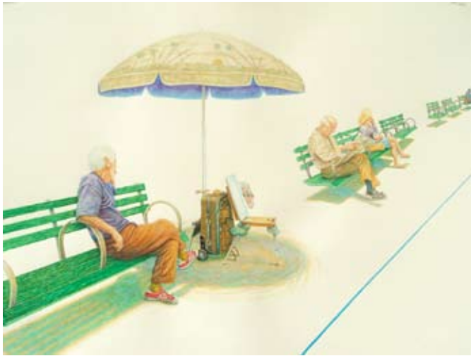
Benches with Umbrella, 2009 , watercolor/paper, 22" x 30".