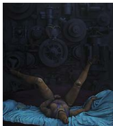
Charles Pfahl Shadow , 2012 Oil on canvas 100 x 90 in. with frame