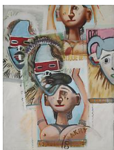
Larry Rivers Mixed Patriotic Stamps , 1976 Oil on canvas 48 x 46 in