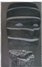
Ian Ingram A Hollow Gamble , 2013 Charcoal, pastel and thread on paper 76 x 50 in. with frame