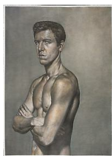
Ian Ingram Self Portrait as Father , 2009 Charcoal, pastel and watercolor on paper 62 x 47 in. with frame