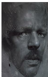
Ian Ingram The Middleman , 2013 Charcoal, pastel, thread, silver leaf and teeth on paper 72 x 50 in. with frame