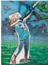
Larry Rivers The Young Archer , 1995 Oil on canvas mounted on sculpted foamboard (Construct) 56.5 x 45 x 5 in