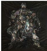
Charles Pfahl Metamorphosis , 1980 Oil on canvas 79 x 73 in. with frame