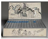
Larry Rivers Dutch Master's Cigar Box , 1970 Cardboard, canvas, aluminum foil, board and paper collage 10 x 16 x 13 in Edition 21/35