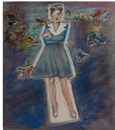
Larry Rivers Fashion and the Birds: White Collar , 1996 Colored pencil, pencil, pastel and collage on paper 23.5 x 21.25 in