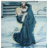
Larry Rivers Make Believe Ballroom; The Dip , 1987 Oil on canvas mounted on sculpted foamboard (Construct) 65.5 x 61.5 x 5 in