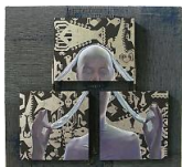
Charles Pfahl It (Wife In 3 Squares) , c. 2009 Oil and silver leaf on panels with textile and petrified lizard 30 x 32 in