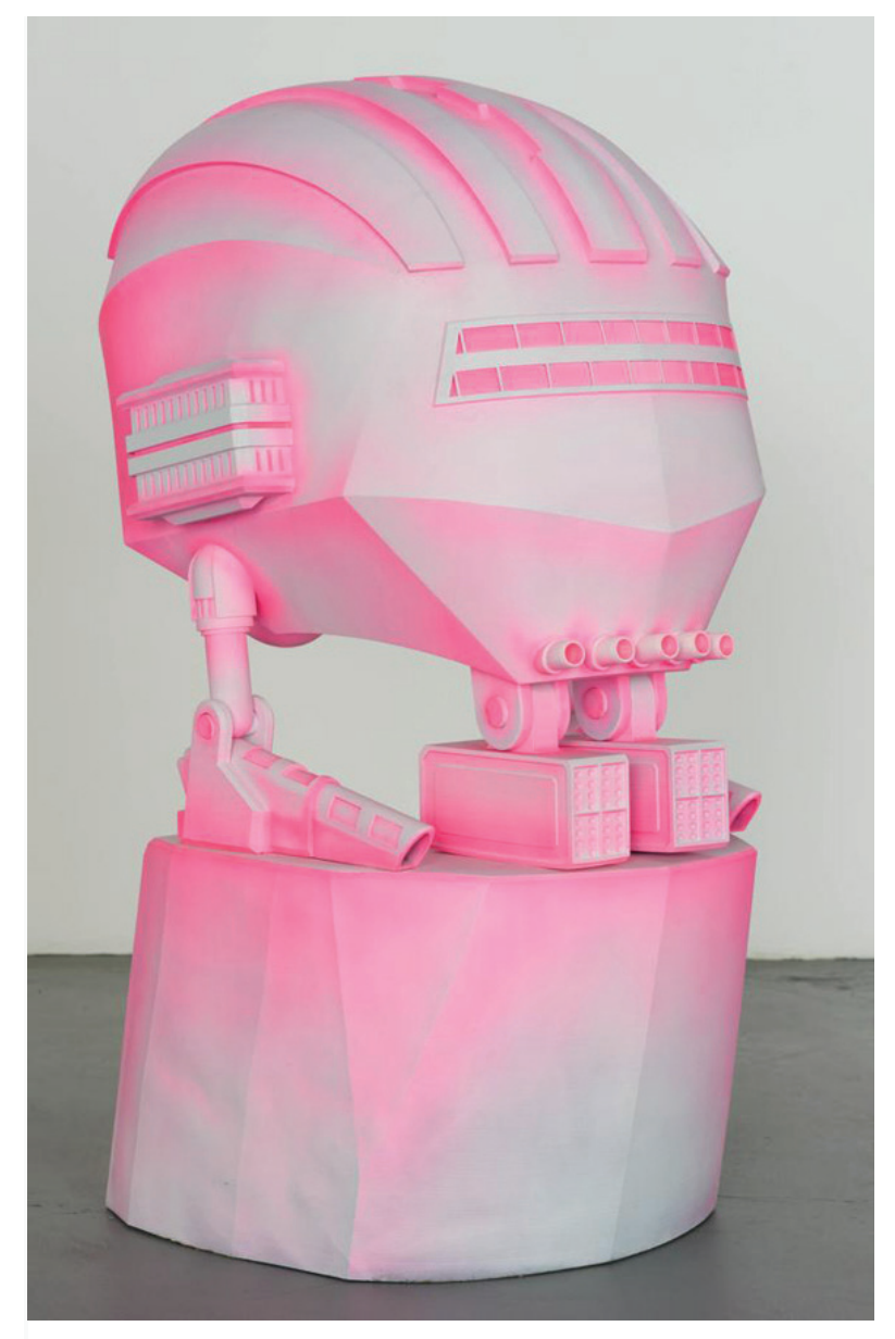
Warhead, 2014. PLA polymer and acrylic, 45 x 24 x 30 in.

Many of your pieces deal with "upgrades" to the human body- do you think this is the future of mankind, and do you see this as a positive or negative thing?