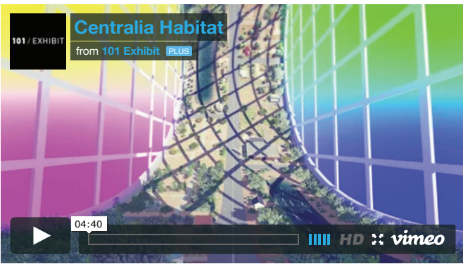
Centralia Habitat from 101 Exhibit on Vimeo.