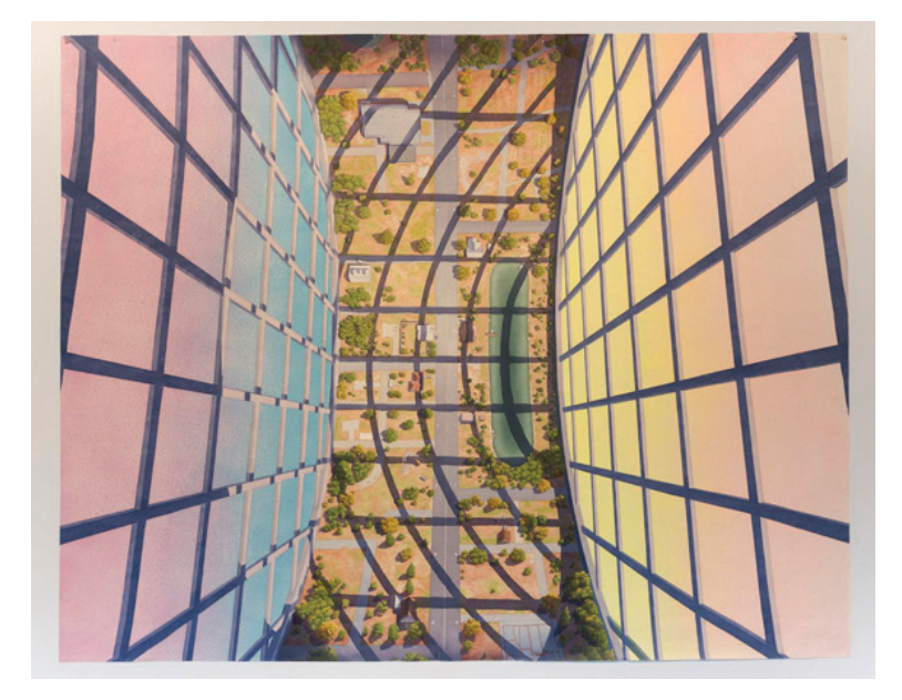
Centralia Habitat: Up, 2014, acrylic on muslin, 60 x 75 in.