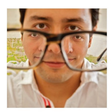
I know the obvious topic of your show is the future, but I feel like drawing inspiration from the events in "Centralia" and even the idea of imagining the future makes it seem like you're actually making a commentary on the past, too. In what ways does your art talk about the past as well as the future?