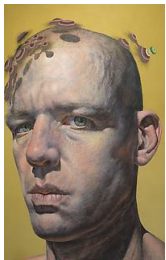
Ian Ingram Promised Land , 2015 Oil and beads on panel 76 x 47 in