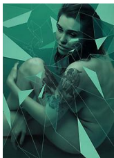
Robin Eley Wright Refracted (Cyan) , 2014 Oil on Belgian linen 70 x 50 in