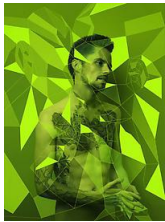
Robin Eley Noble Refracted (Green) , 2014 Oil on Belgian linen 75 x 55 in