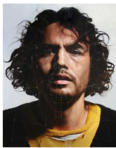
Robin Eley FLUX , 2015 Oil on aluminum panel, Plexiglass, and LumiSheet LED light panel 78 x 60 in