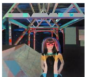
Kristen Schiele Berlin Girl , 2015 Silkscreen, acrylic and oil on canvas 38 x 45 in