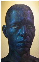
Ian Ingram Minotaur , 2015 Oil, gold leaf and copper wire on panel 76 x 47 in