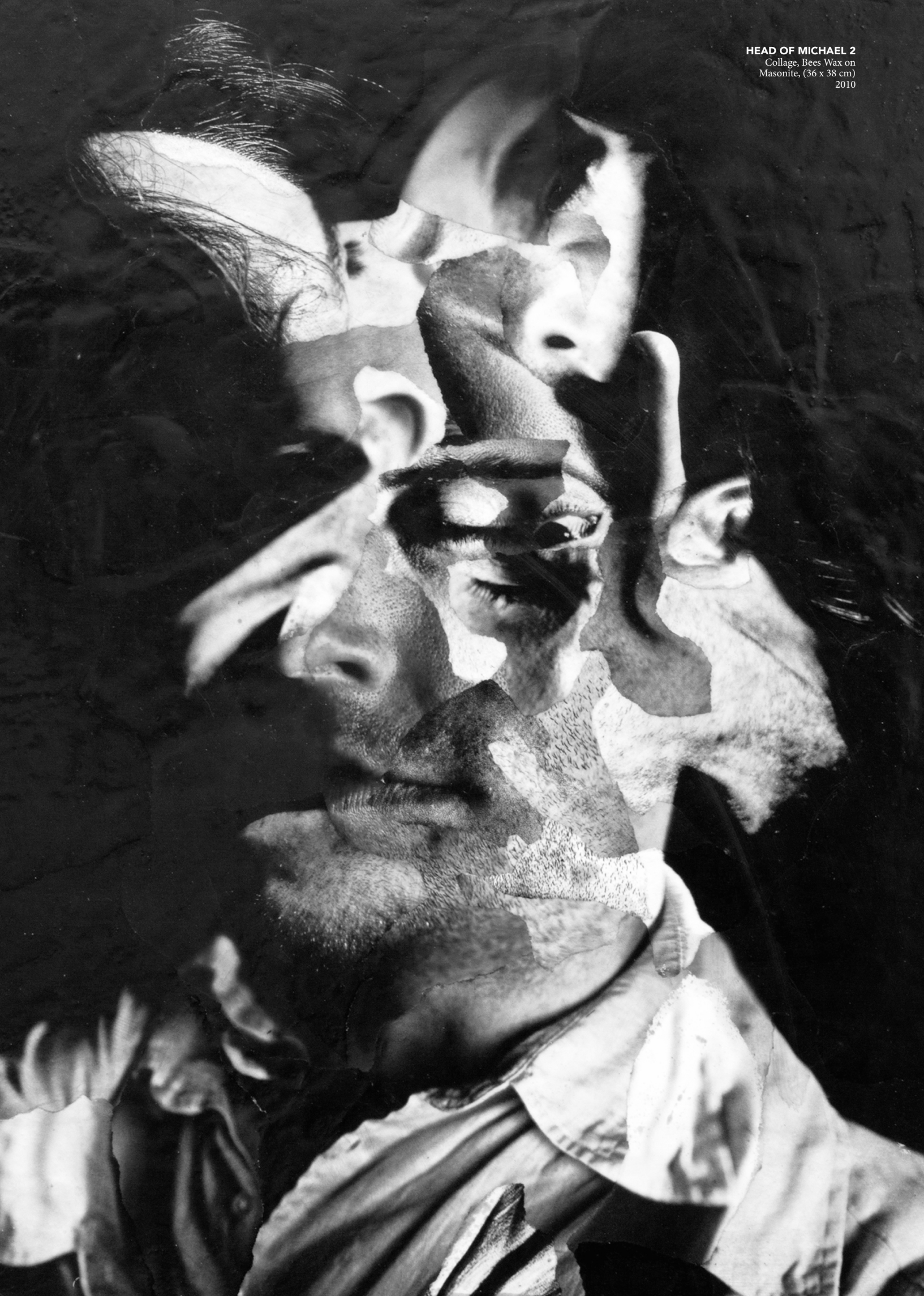
HEAD OF MICHAEL 2 Collage, Bees Wax on Masonite, (36 x 38 cm) 2010