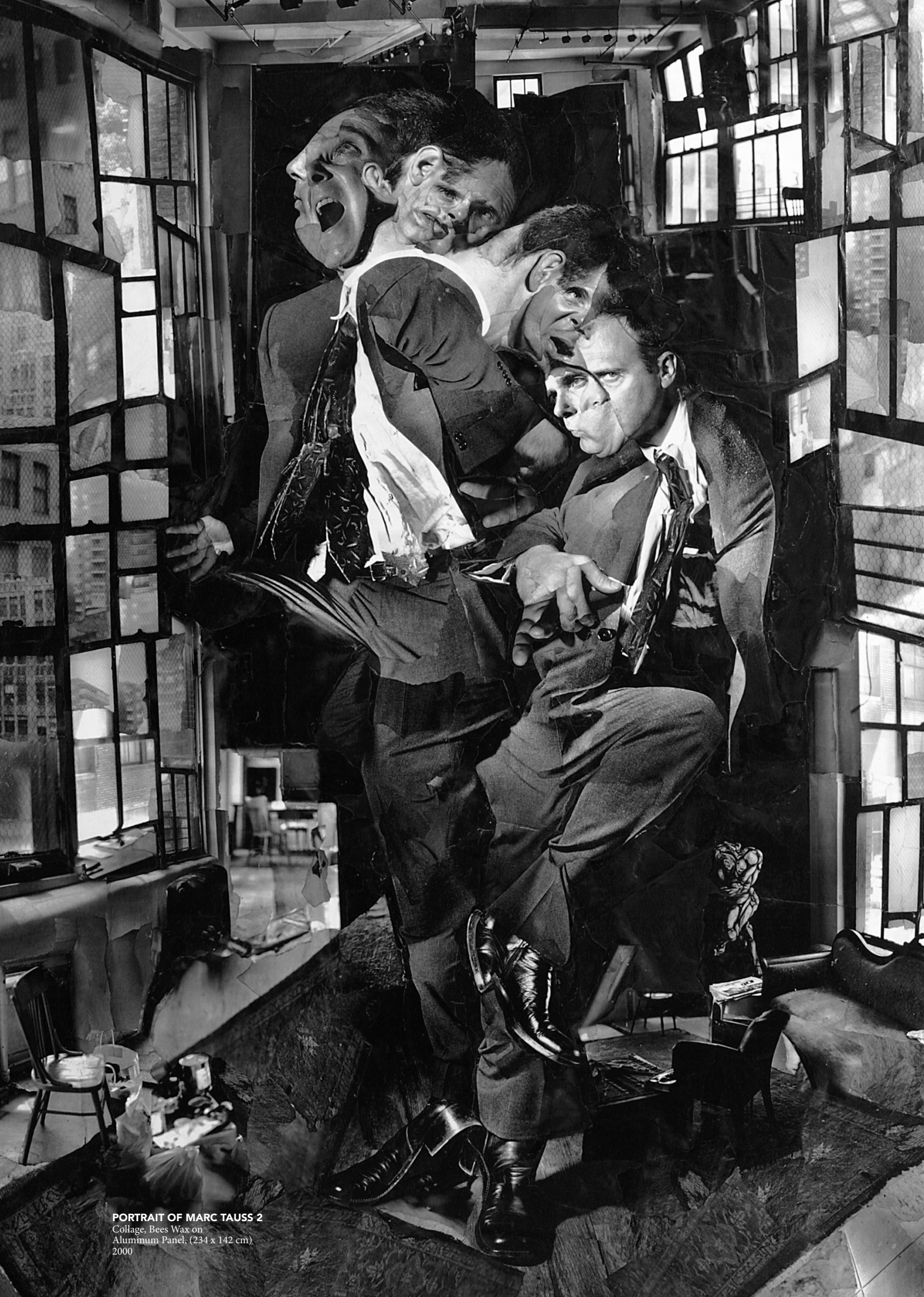
PORTRAIT OF MARC TAUSS 2 Collage, Bees Wax on Aluminum Panel, (234 x 142 cm) 2000