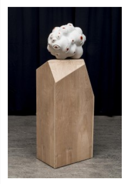
Tanya Batura, Untitled, 2014

Imagine meeting someone, and knowing that you will one day fall madly in love with that person, and you have mastered the Japanese concept of Koi No Yokan. Love is not immediately