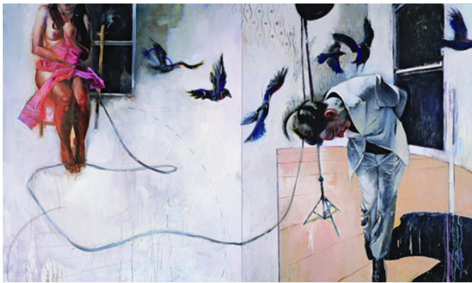
Jason Shawn Alexander, "No Good at Exits," 2013, ink, polyurethane, graphite, oil, and paper on canvas, 60 x 101 in.

The exhibition marks Alexander's fourth solo display with 101/EXHIBIT. It is also the inaugural exhibition for the gallery's new space, located at 6205 Santa Monica Blvd. in Los Angeles.