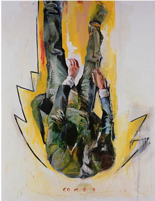
Jason Shawn Alexander, "Comet," 2014, ink, polyurethane, pastel, oil, and paper on canvas, 70 x 54 in. 101/EXHIBIT

Alexander's aggressive and provocative figure paintings provide a truly memorable aesthetic experience. The artist weaves together various modes of representation in an imaginative environment that also alternates between abstract, representational, and decorative space. In these works human figures undergo distortions of form and color that distance them from the men and women we encounter in the natural world. Still, powerfully rendered passages of human anatomy, evocative postures, and psychologically revealing gazes make a connection with Alexander's figures almost inevitable.