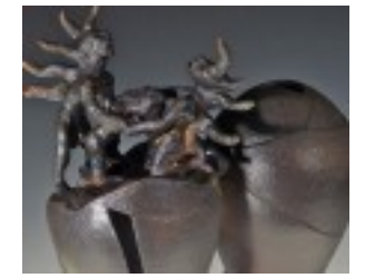
Brian Ransom: Whistling Water Vessels