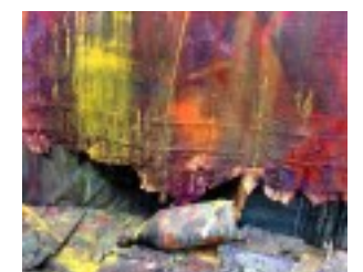
Poesia & Geso: Un-Formal