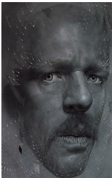
Ian Ingram The Middleman , 2013 Charcoal, pastel, thread, silver leaf and teeth on paper 72 x 50 in. with frame