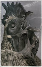
Ian Ingram Inseparable Thieves , 2013 Charcoal and pastel on paper 68 x 42 in