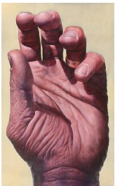
Ian Ingram Evidence , 2015 Oil on panel 76 x 47 in