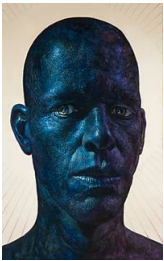
Ian Ingram Minotaur , 2015 Oil, gold leaf and copper wire on panel 76 x 47 in