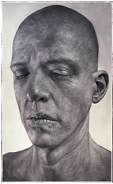
Ian Ingram Ignoring I , 2012 Charcoal, pastel and thread on paper 82 x 51 in