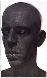
Ian Ingram Ignoring II , 2012 Charcoal, pastel and thread on paper 82 x 51 in