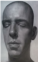
Ian Ingram Ignoring III , 2012 Charcoal and pastel on paper 82 x 51 in