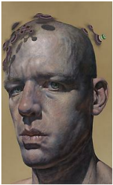
Ian Ingram Promised Land (Sold) , 2015 Oil and beads on panel 76 x 47 in