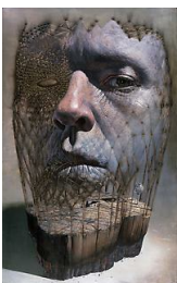
Ian Ingram Each Other , 2014 Oil and wire on panel 76 x 47 in