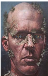
Ian Ingram Crossing Out , 2016 Oil on panel 76 x 47 in