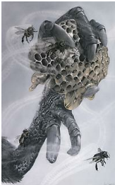
Ian Ingram To Burgle or Borrow (Sold) Charcoal and pastel on paper 68 x 42 in