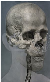
Ian Ingram Of Salt and Faith (Sold) , 2013 Charcoal, pastel and thread on paper 68 x 42 in